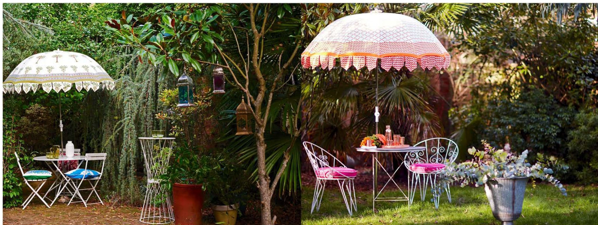
Fan Palm Parasol