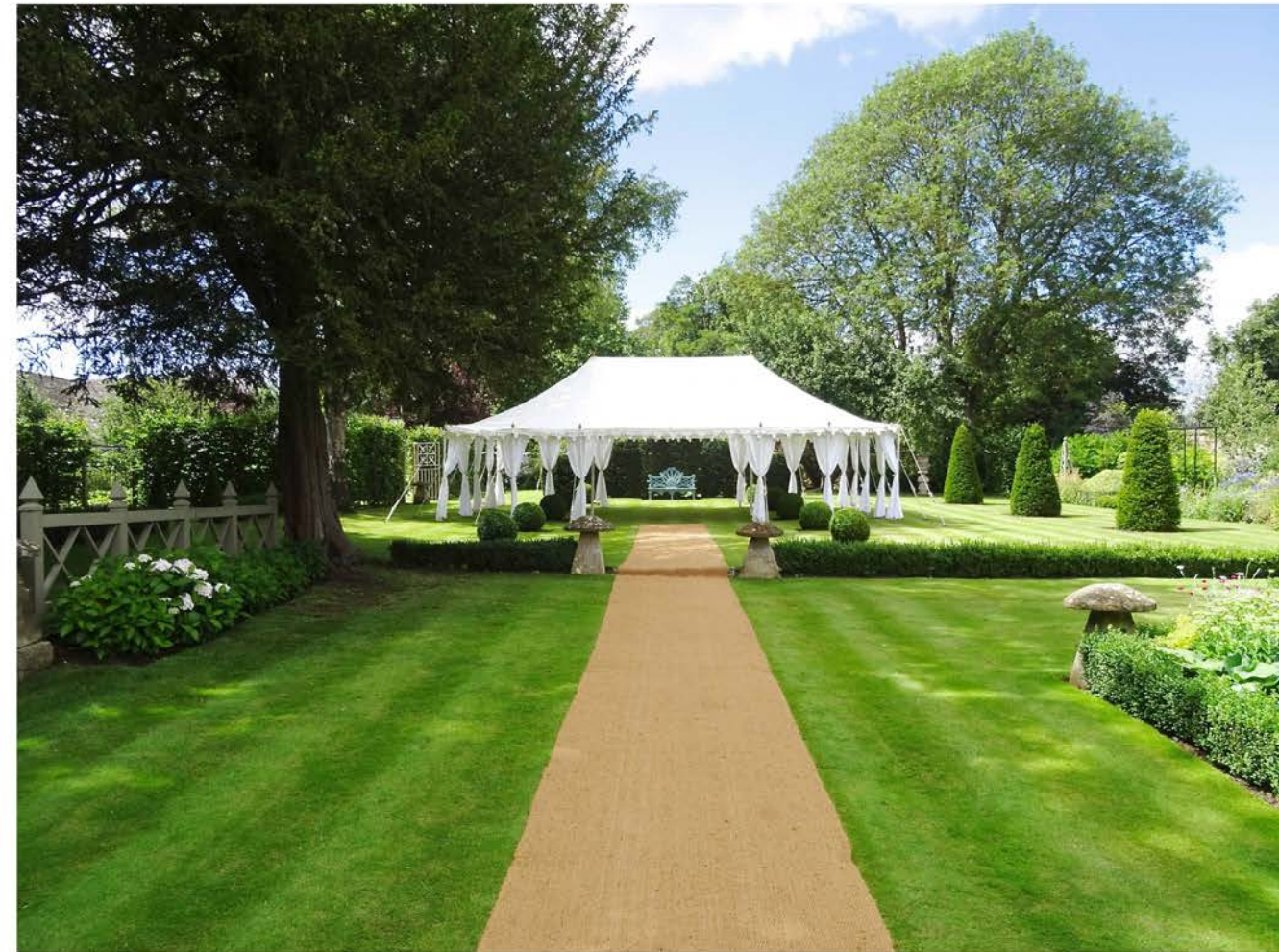
Single Maharaja 10m x 6m