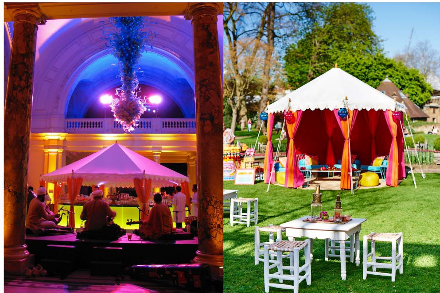
Pavilion 6m & Pavilion 4m