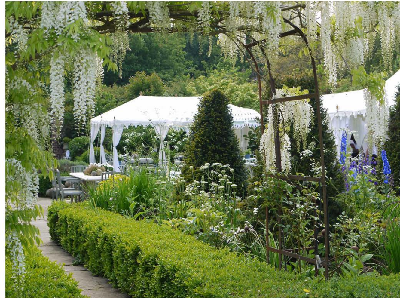
Metal Frame Tent 6m x 4m