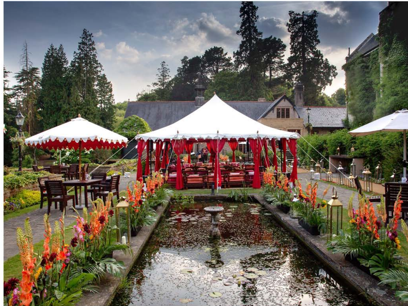
Single Maharaja 6m x 10m at Pennyhill Park Hotel