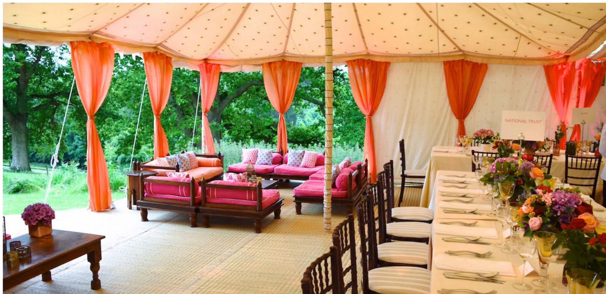
Low wooden furniture