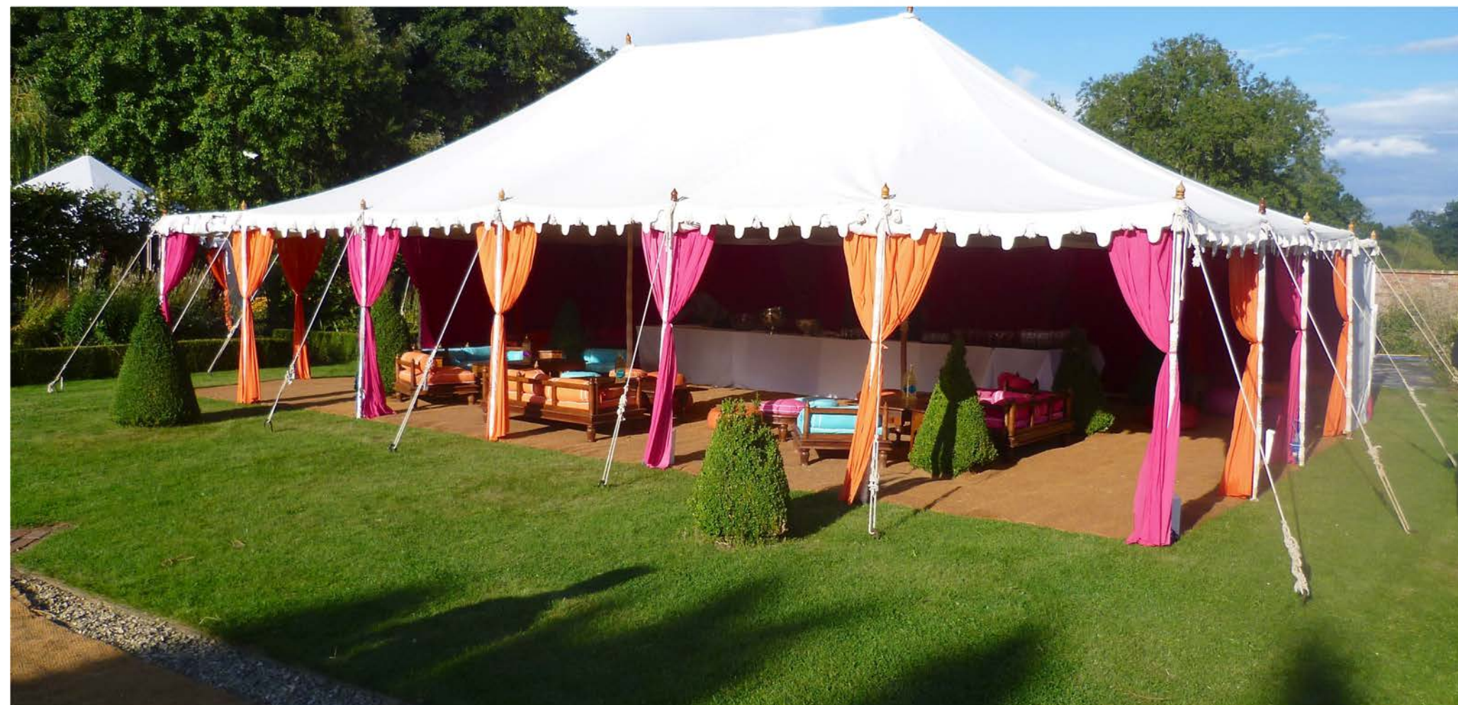
Mahal Tent 8m x 12m