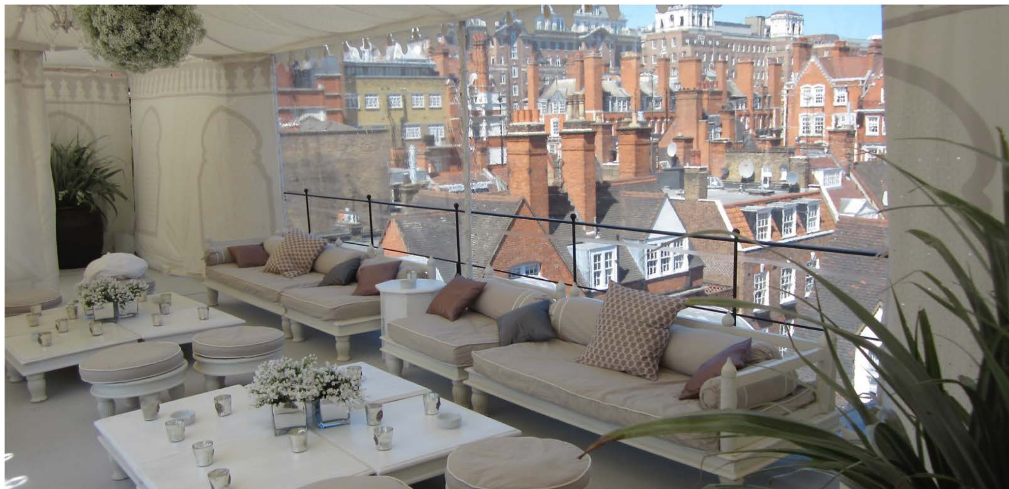
Raj Tent on clients roof terrace