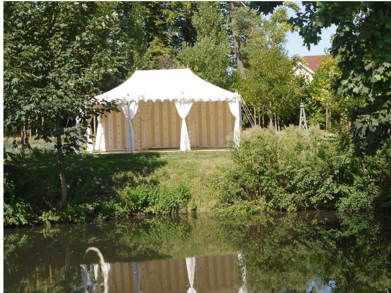
Traditional Raj Tent 6m x 4m