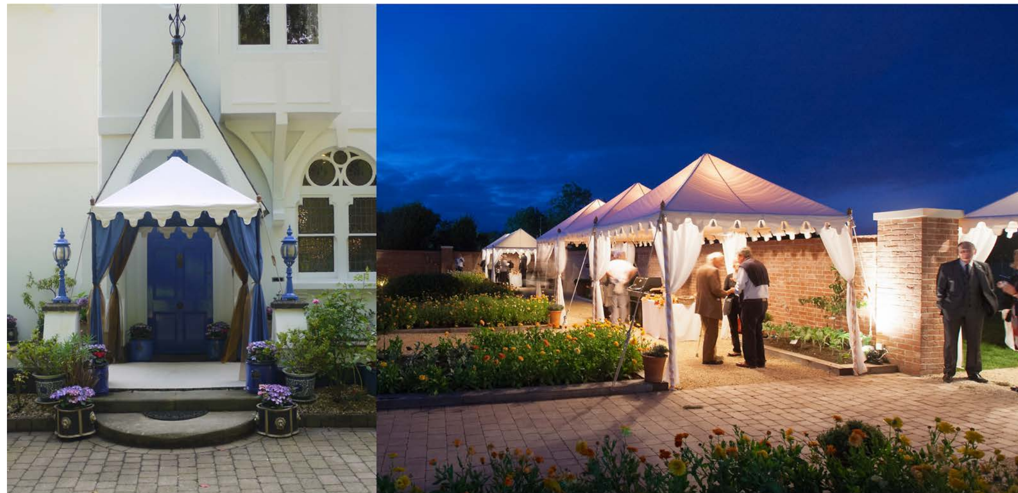
Pergola 2m x 2m