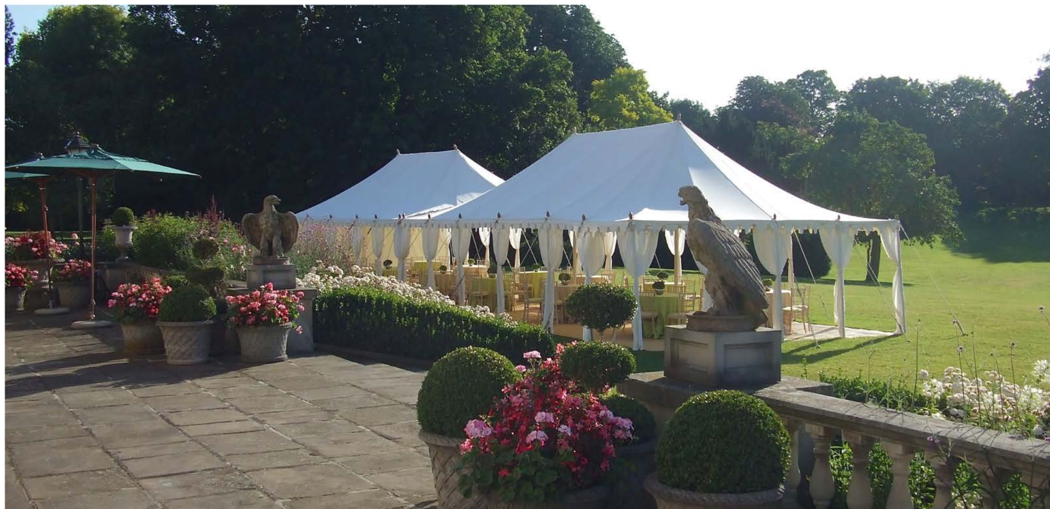
Double Maharaja 6m x 20m