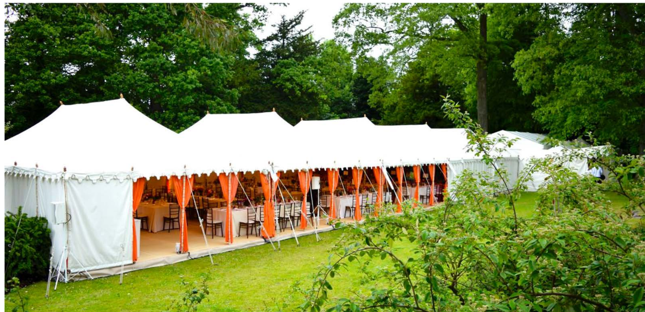
Quadruple Maharaja 10m x 24m