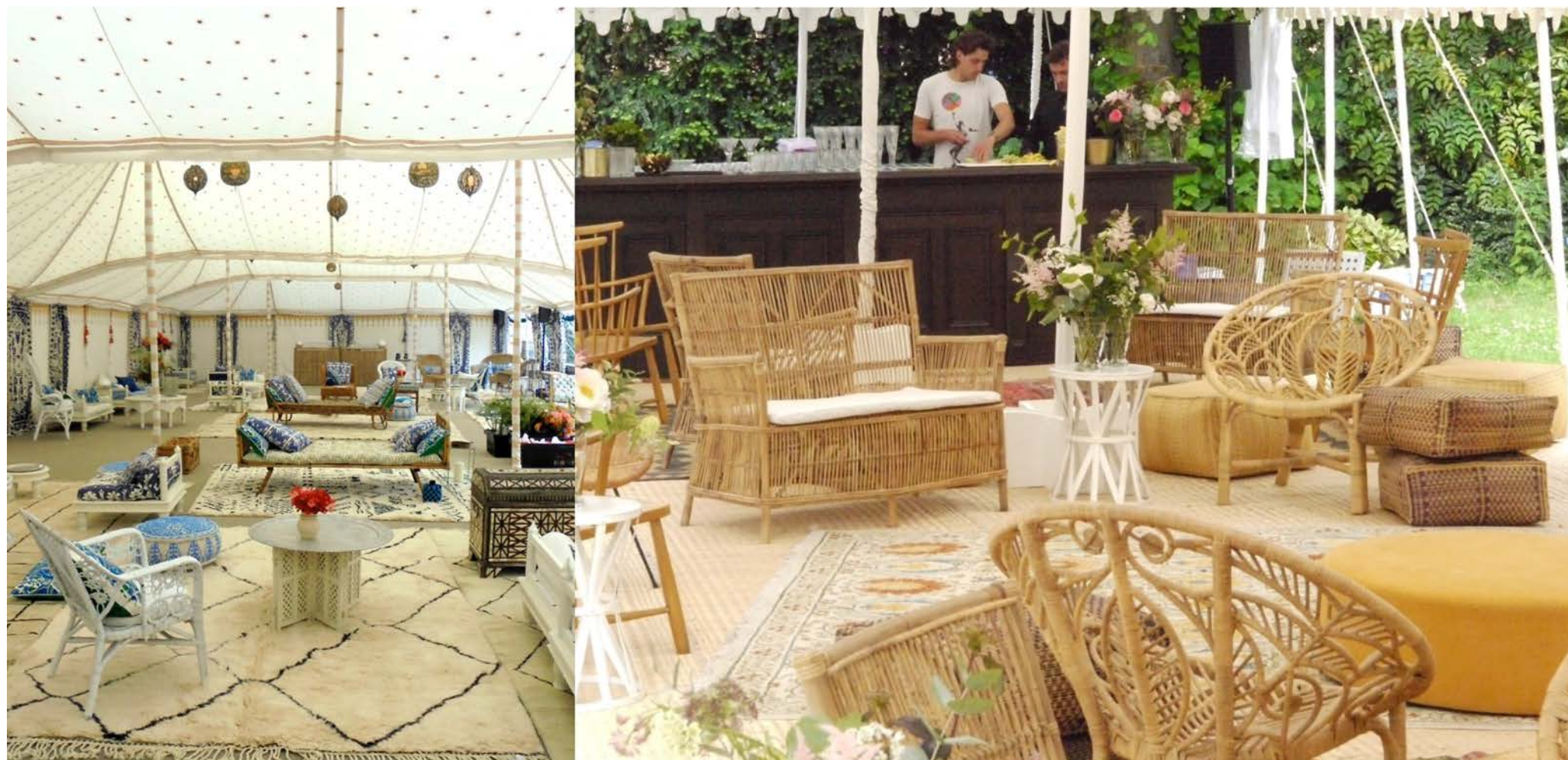
Selection of furniture