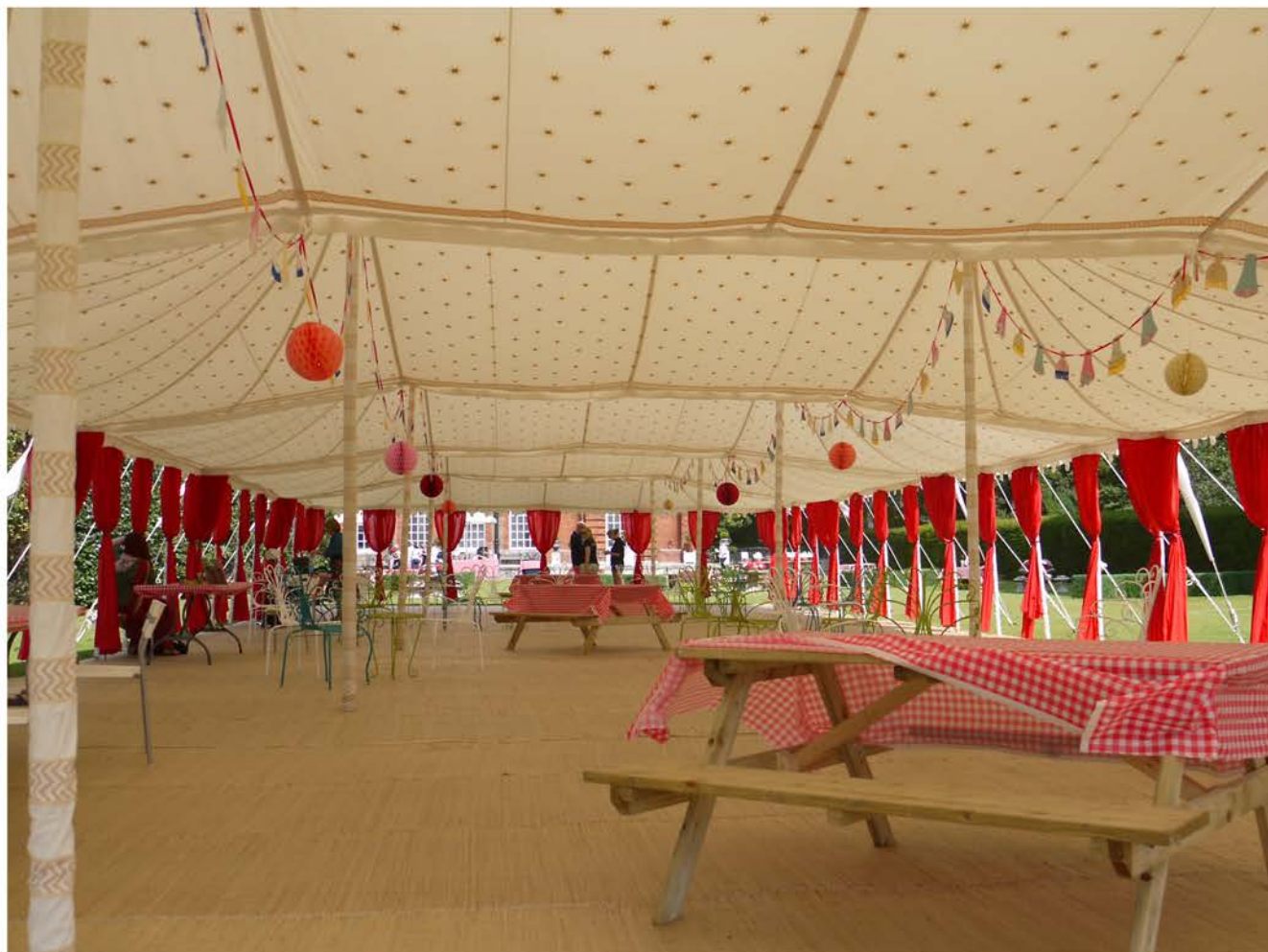
Quintuple Maharaja 10m x 30m at Kensington Palace Orangerie