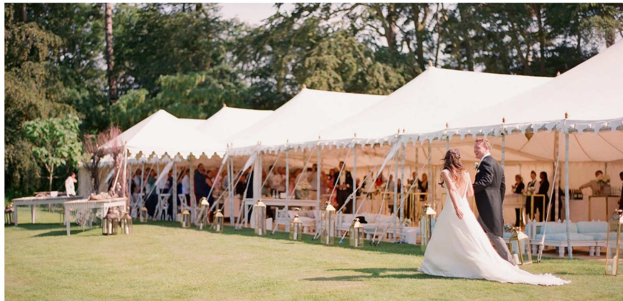
Quintuple Maharaja 10m x 30m with entrance Pergola 2.8m x 2.8m