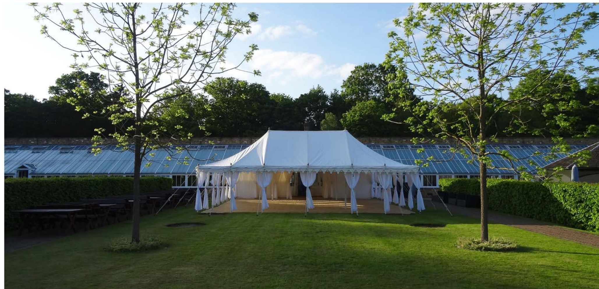
Double Maharaja 10m x 12m at The Grove