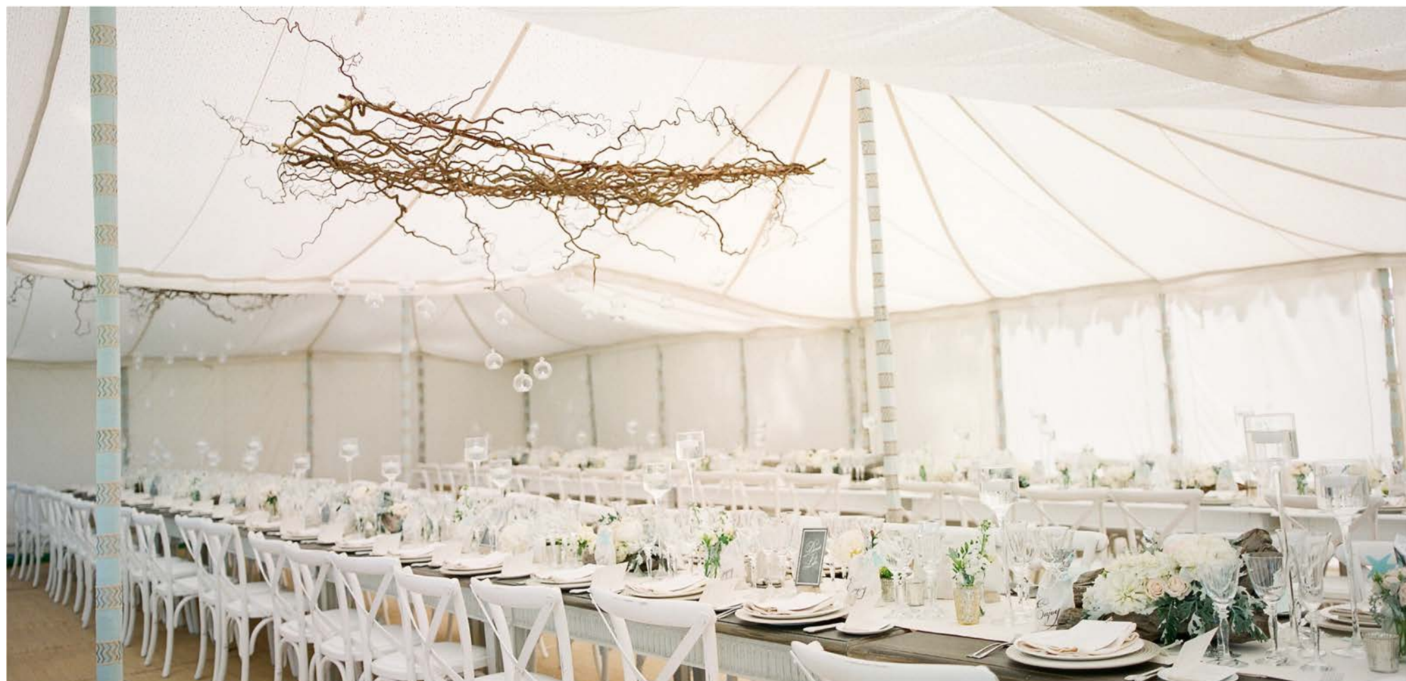
Dining on long tables