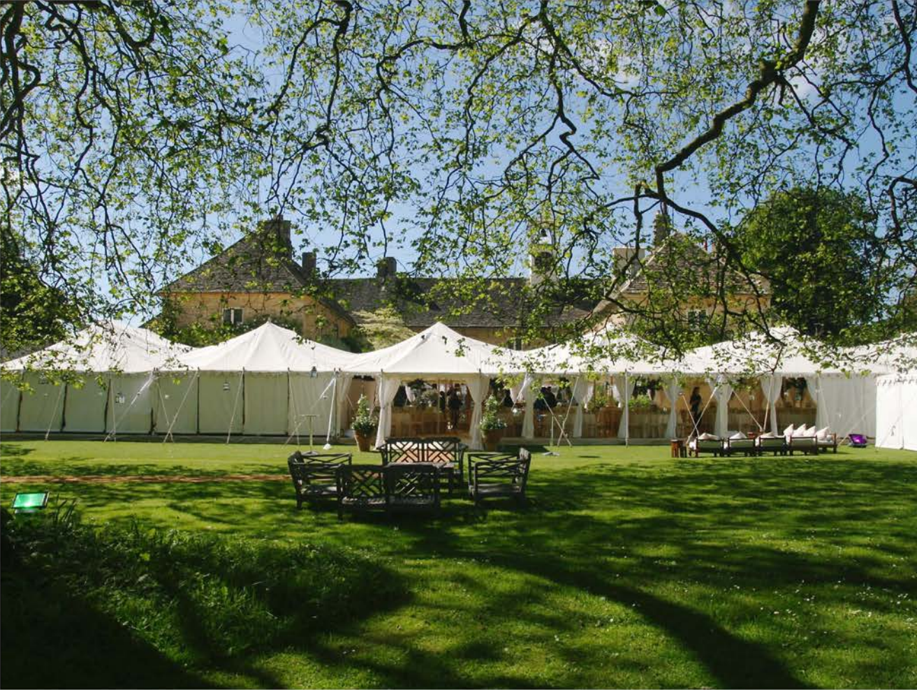
Sixtuple Maharaja 10m x 36m