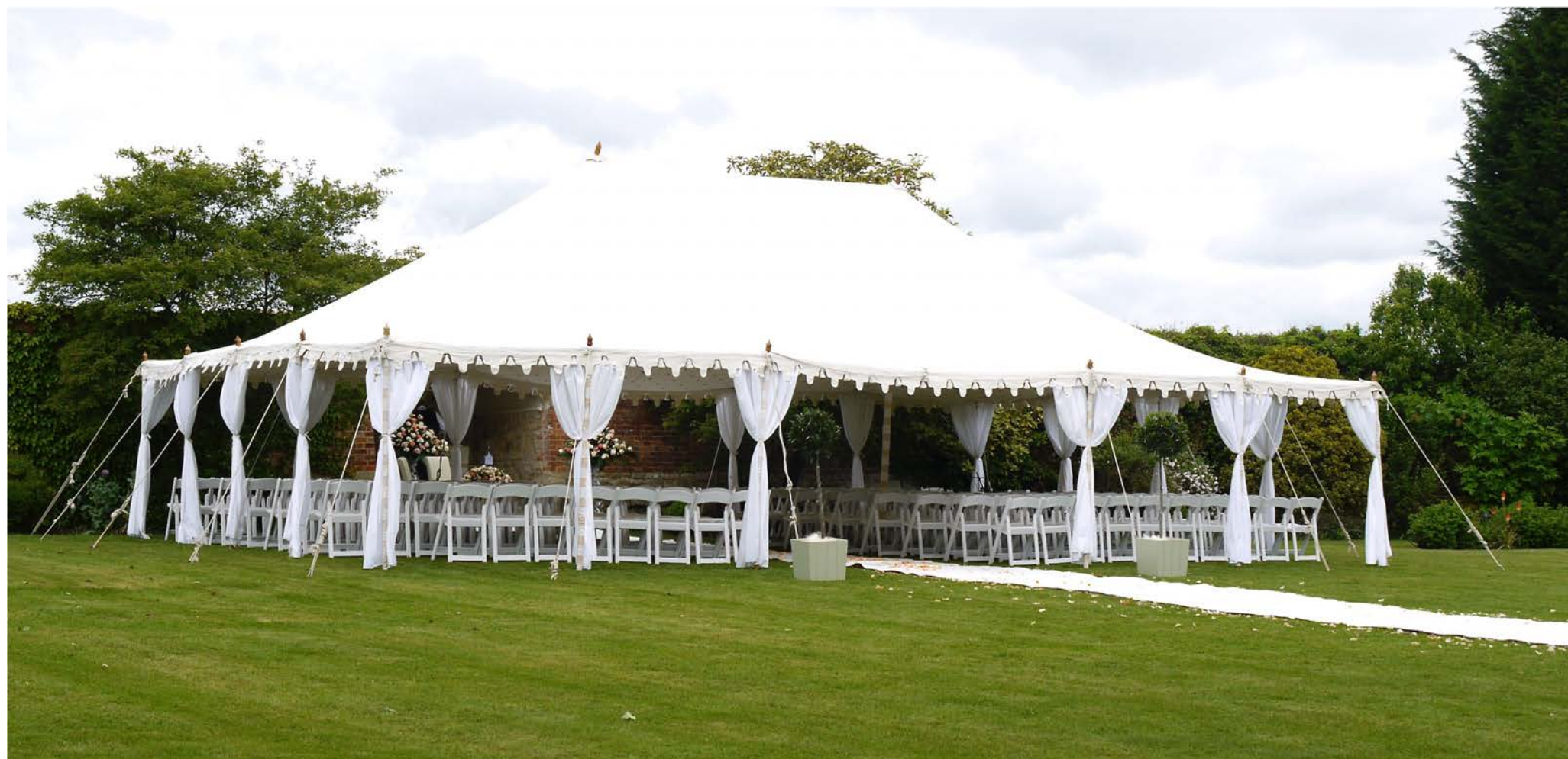
Mahal Tent 8m x 12m